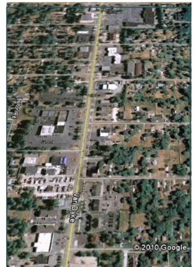
Aerial of Van Dyke Avenue, south of 22 Mile Road

In May, following a competitive bidding process, the DDA recently hired the civil engineering firm of Spalding DeDecker to prepare preliminary engineering plans for the extension of a sanitary sewer line. These preliminary design plans will help determine the cost and feasibility of constructing the sewer. This information is prerequisite to establishing a Special Assessment District (SAD)